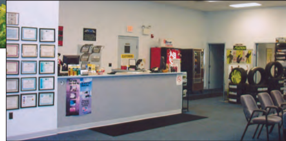
Number One Tire and Service averages about 180 work orders each week. The shop prides itself in being a clean and attractive facility.